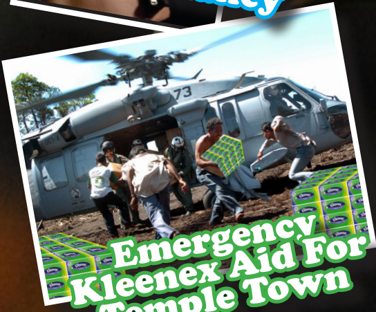
Emergency Kleenex Aid For Temple Town