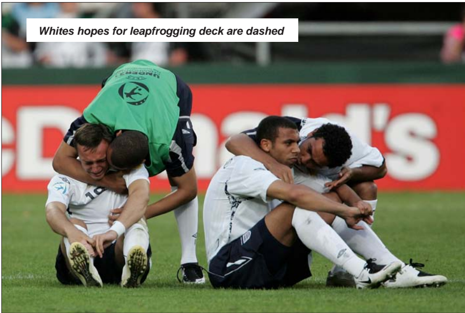
Whites hopes for leapfrogging deck are dashed