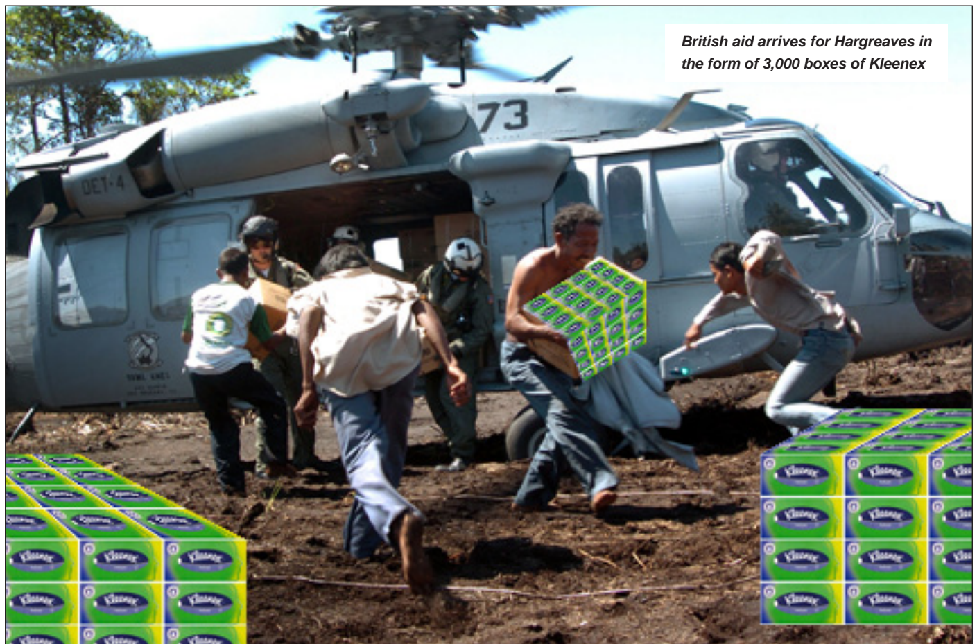
British aid arrives for Hargreaves in the form of 3,000 boxes of Kleenex

Sent three girls round and they said they couldn't find yuour tinky winky, so they ended up playing with themselves. They said your eye lashes were bigger than your tinky. - Temple