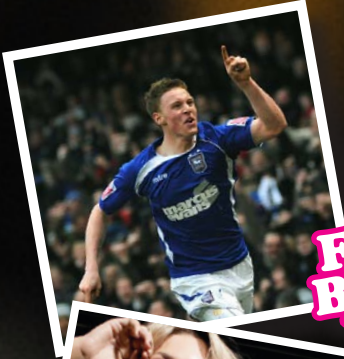
Four For Blues Not Enough